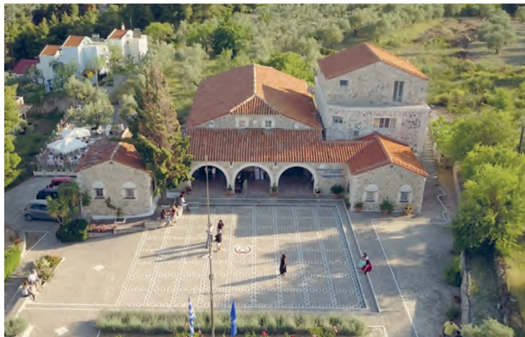
The International Academy of Classical Homeopathy

any case, this movement is different from the original movement of electrons when the system was in a state of healthy balance.