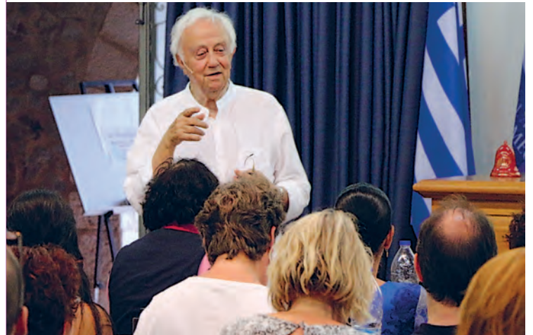
Professor Vithoulkas teaching doctors on a postgraduate course at the IACH